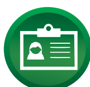
ID Card Students, Staffs & Parents