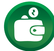
HR Management with Payroll