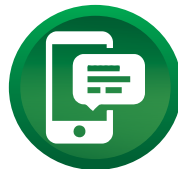
SMS & Email Alert System