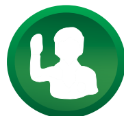
Time Table Class, Exam & Teacher