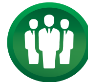
User Access Management