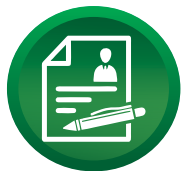
Student Admission & Cancellation System

Features: School Management Software is a web based & window based application in which users can access anywhere anytime. SMS allows you to store modify and retrieve information using the pull down menus for all the modules. The software includes many modules like: