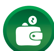
Cheque Clear & Bounce System