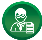
Student Maintenance & GR System