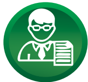
Mark Sheet with CCE Result