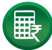
Fees Collection System