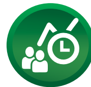
Attendance Students & Staffs