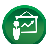
Daily Collection & Fees Pending Register