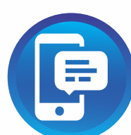
SMS & Email Alert System