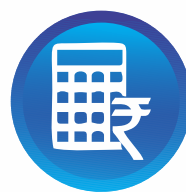
Fees Collection System