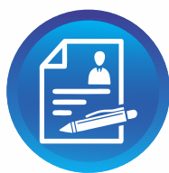
Student Admission & Cancellation System

Features: College Management System is a web based & window based application in which users can access anywhere anytime. CMS allows you to store modify and retrieve information using the pull down menus for all the modules. The software includes many modules: