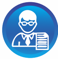
Mark Sheet with CCE Result