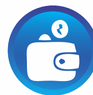
HR Management with Payroll