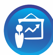
Daily Collection & Fees Pending Register