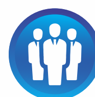
User Access Management