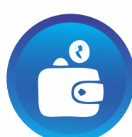
Cheque Clear & Bounce System