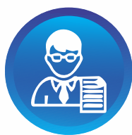
Student Maintenance & GR System