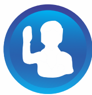
Time Table Class, Exam & Teacher