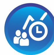
Attendance Stuents & Staffs