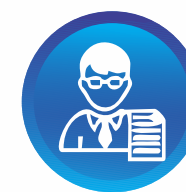
Student Document Manage