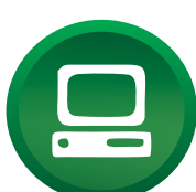
Fees Collection System