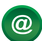
Mail Alert System