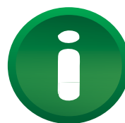
ID - Card System