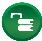
Cheque Bounce System