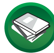
Library Management System