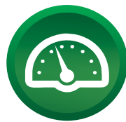
Exam Time Table System