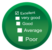
Mark Sheet System