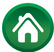
Student Admission System

Features: School Management Software is a web based & window based application in which users can access anywhere anytime. SMS allows you to store modify and retrieve information using the pull down menus for all the modules. The software includes many modules like: