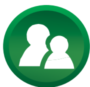
Student Maintenance System & GR