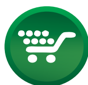
Asset & Inventory System