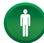
Student Attendance System