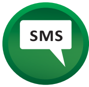
SMS Alert System