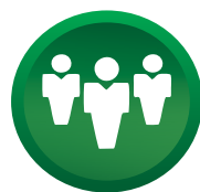
Staff Management System