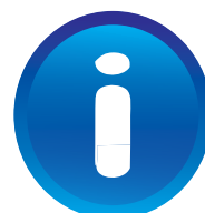
ID - Card System