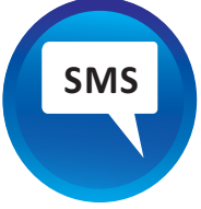
SMS Alert System