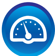
Exam Time Table System