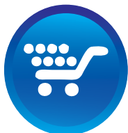
Asset & Inventory System