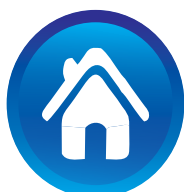
Student Admission System

Features: College Management System is a web based & window based application in which users can access anywhere anytime. CMS allows you to store modify and retrieve information using the pull down menus for all the modules. The software includes many modules: