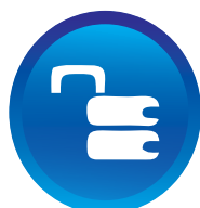
Cheque Bounce System