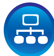
User Management System