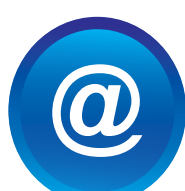
Mail Alert System