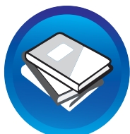
Library Management System