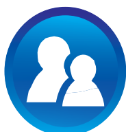
Student Maintenance System & GR