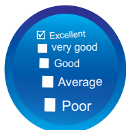
Mark Sheet System