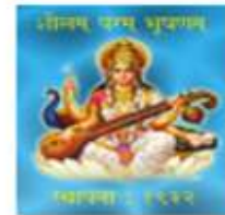
Jogeshwari Education Society