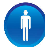
Student Attendance System