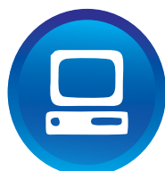
Fees Collection System