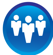
Staff Management System